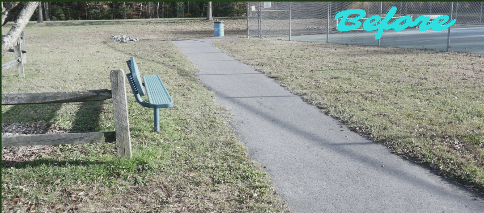
Baggett Park- court entrances