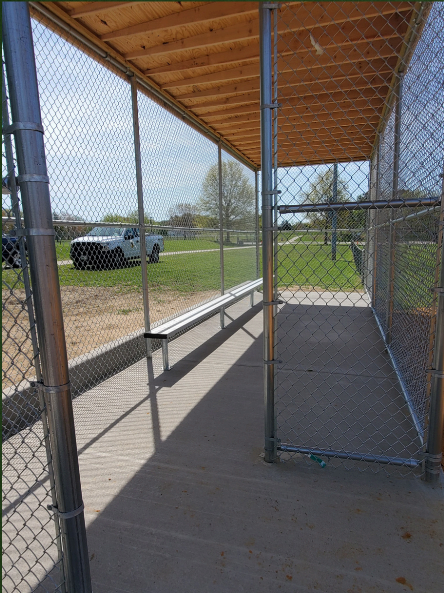
Chancellors Run Regional Park