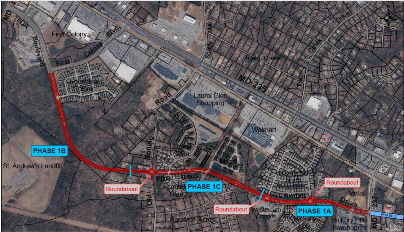
Phase 1 Construction Phasing (A, B & C)