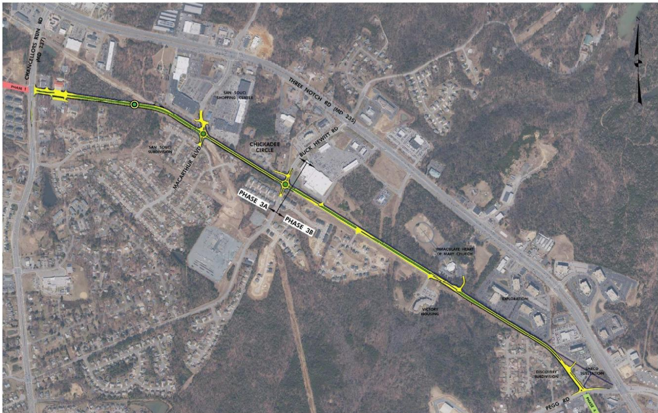
Phase 3 Construction Phasing (A & B)