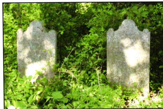
Restored marble stones of the Dixon family. St. Inigoes