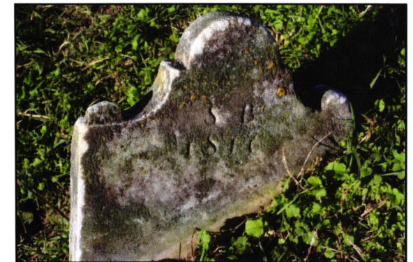
Example of foot marker found at private cemetery