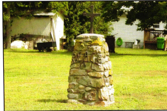
Slave Cemetery at the site of the Plains